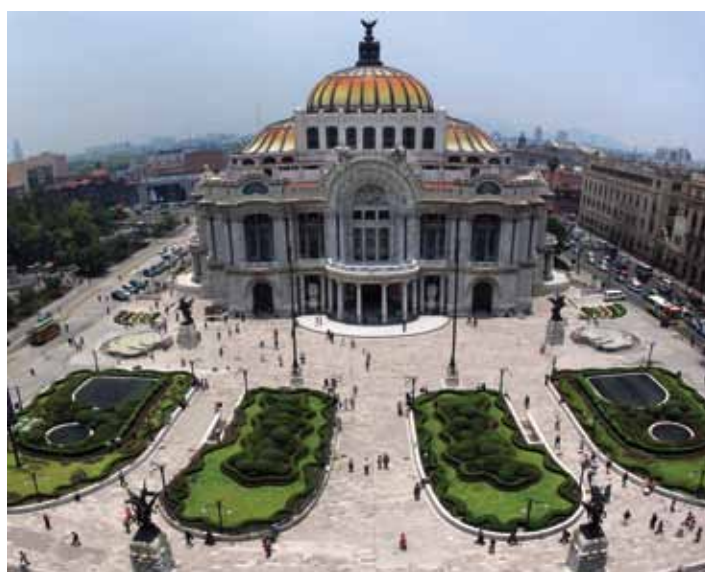
Right: Palacio de Bellas Artes