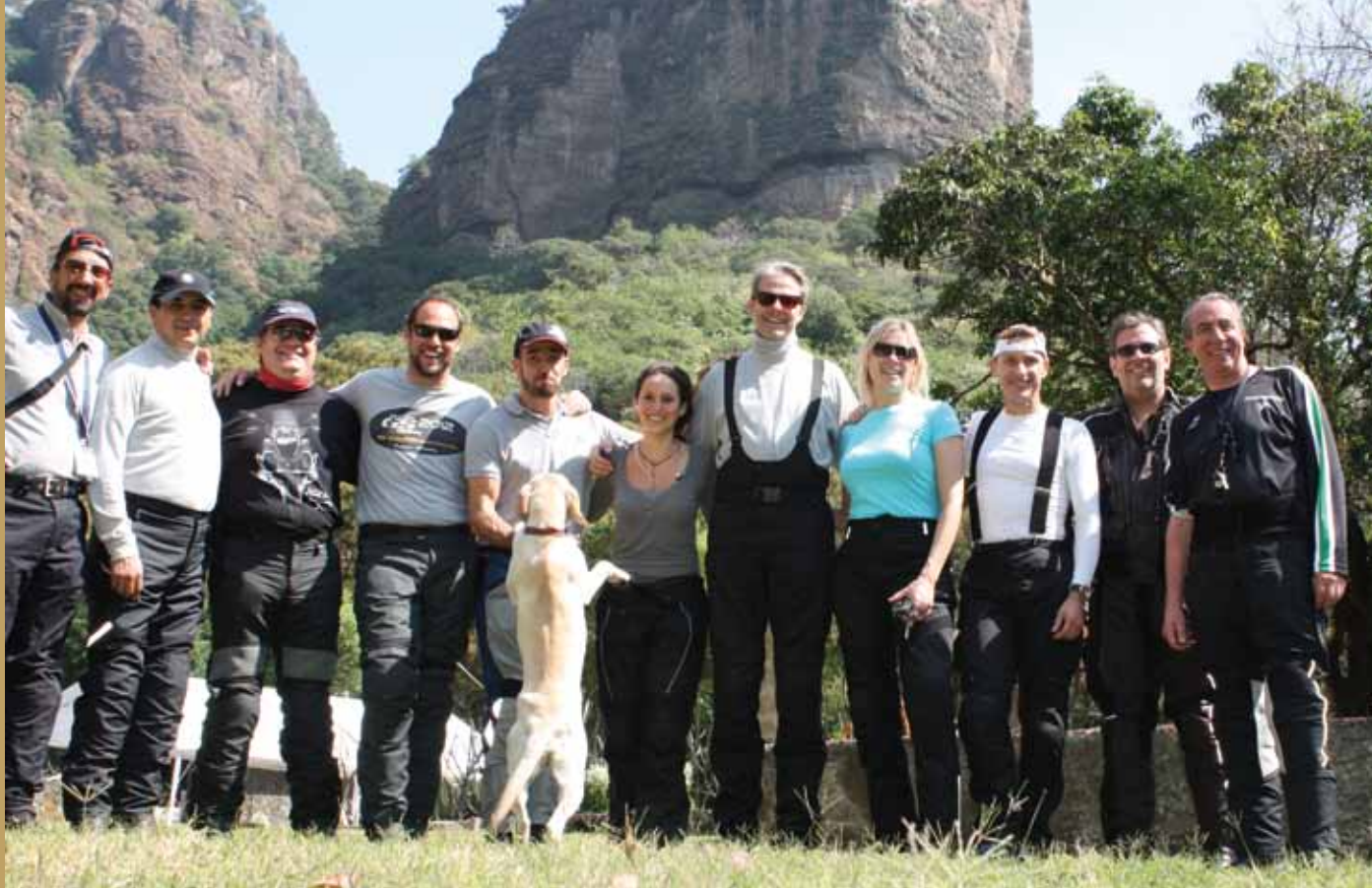
Crew and friends with "Squash" in Tepoztlan Morelos